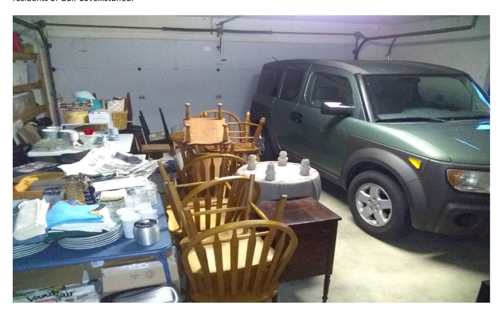
I guess we're not doing too badly, at least we can still get one car in.

The fun began with the need to remove all our worldly possessions that were located on, or within 3 feet straight up from, the old floor surface. All that we could leave in place was the BIG furniture. But even the beds had to be stripped of all the linens. The logical resting place for all this stuff is the garage, and ours now looks like that of most of the rest of the residents of Gulf Cove...stuffed.